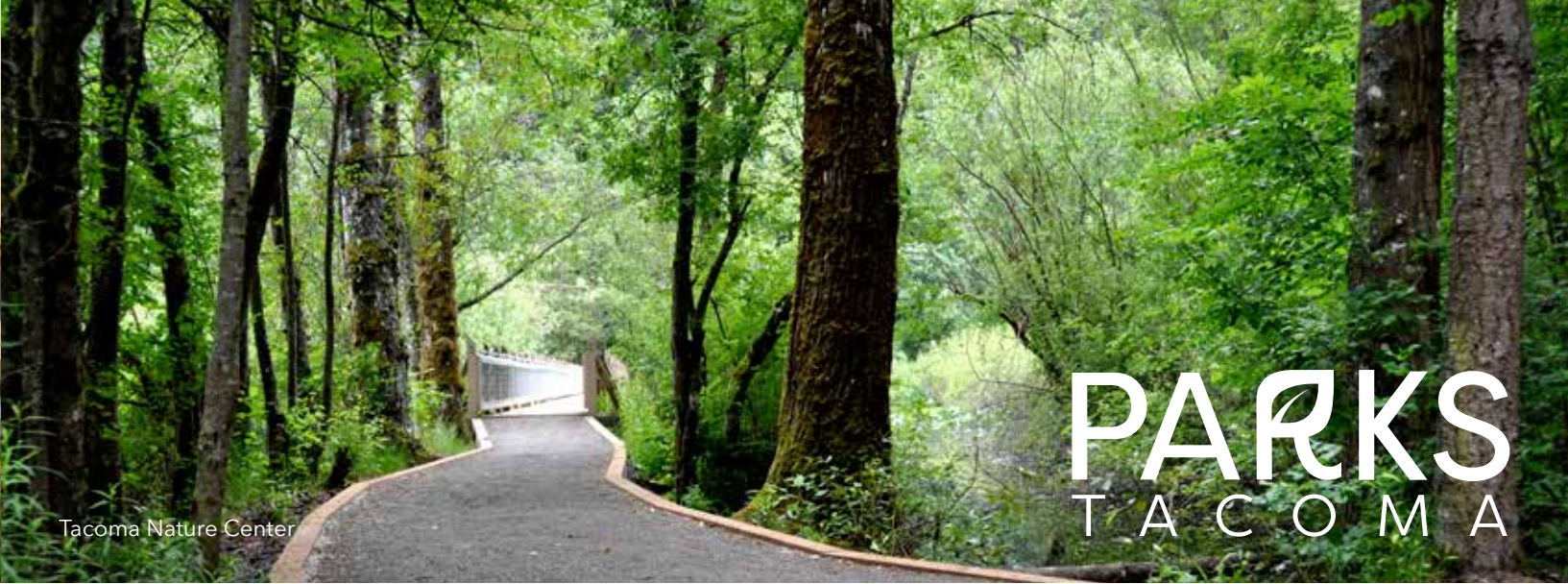
Tacoma Nature Center